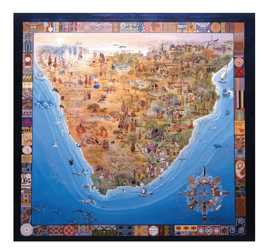
Figure 9.1: Charlotte Firbank-King Ethnic map of Southern Africa , 1990. Digital Print of original Gouache on paper, 150 x 150cm.

have historically systematically been excluded. Resembling a collage, it uses decontextualised images with authority to achieve this. As shown throughout the chapter, the artist went to great lengths to research the detail of the image. By meticulously drawing on known histories, the image acts as an authoritative visualisation of the past it presents.