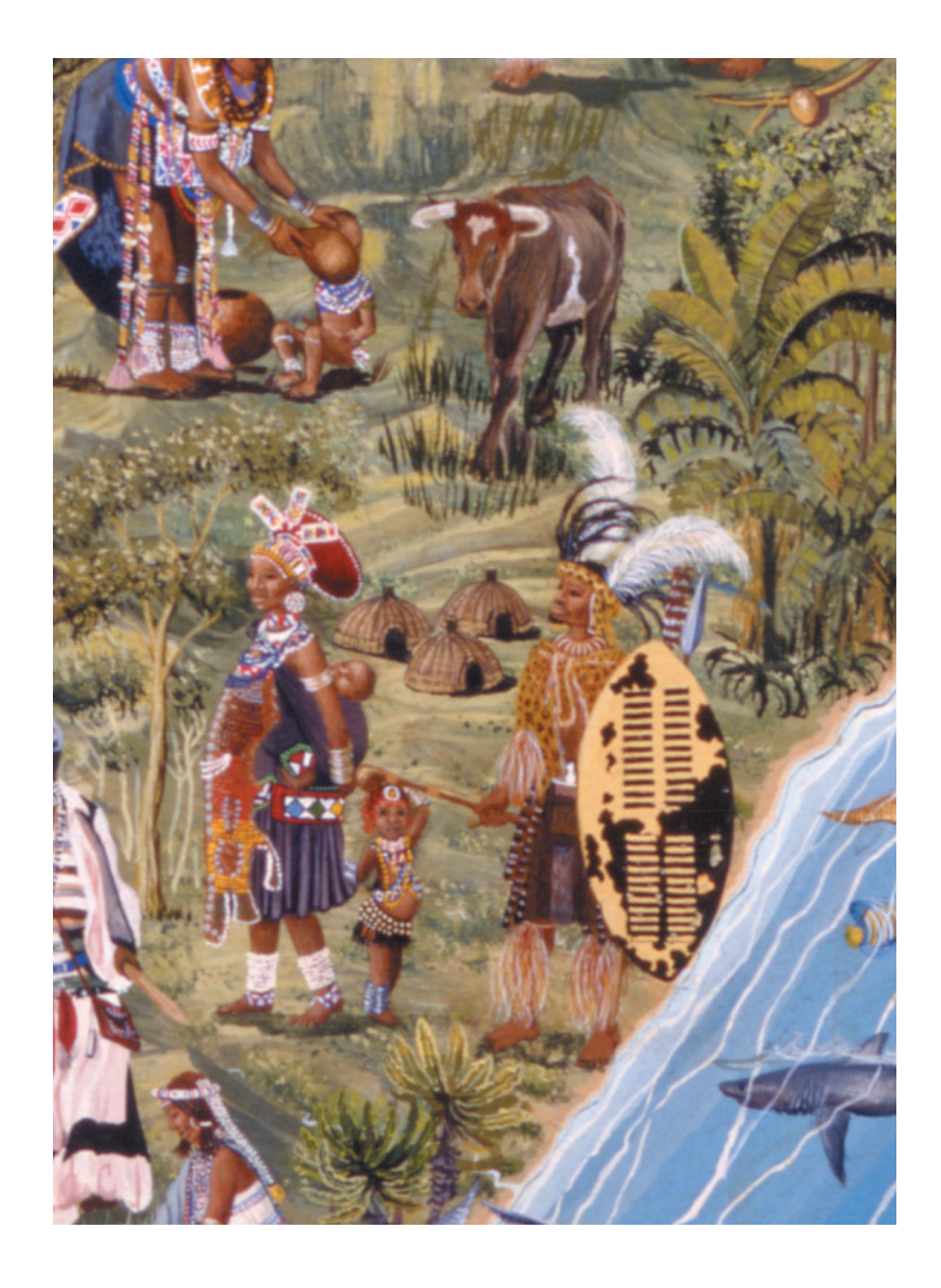
Figure 9.3: Man holding cow hide shield: Detail of Charlotte Firbank-King's Ethnic map of Southern Africa .