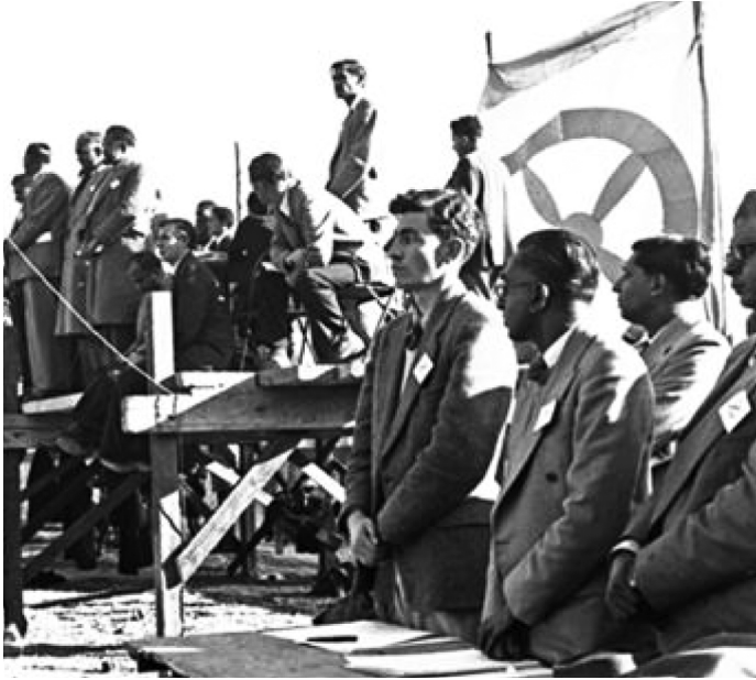
Twenty-one-year-old Albie Sachs (centre) at a meeting of The Congress of the People to adopt the Freedom Charter, Kliptown, 1955

which was later turned into a play and produced by the Royal Shakespeare Company. 682